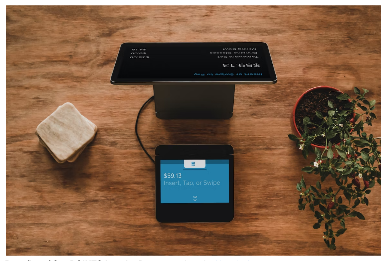
Benefits of StarPOINTS Loyalty Program

By applying to StarPOINTS loyalty program, members will receive various benefits. Here are some of the benefits that members will receive.