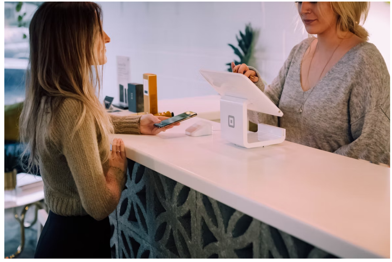
StarPOINTS Integration with Rosalita's Cantina

StarWORKS Global is pleased to announce that we are partnering with Rosalita's Cantina to implement <u>StarPOINTS</u> Loyalty Programs. This collaboration marks a milestone for our company as we continue to move forward and revolutionize the hospitality industry.